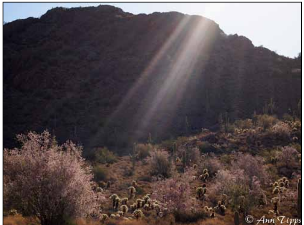
Early morning in Gold Canyon, AZ, in May 2011