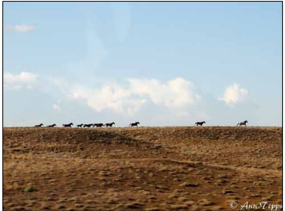
Wild Horses running across Ute Reservation southwest of Durango, CO, in September 2011